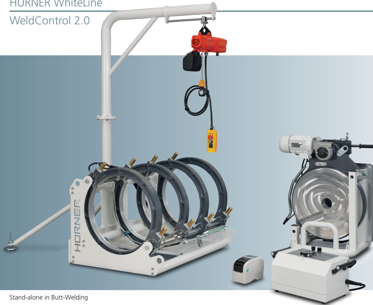
Stand-alone in Butt-Welding