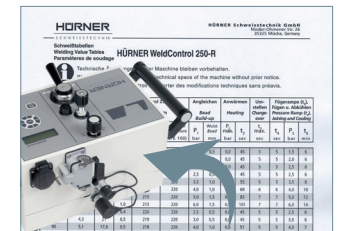
WeldControl jointing – no errors, no welding parameter look-up, but data recording