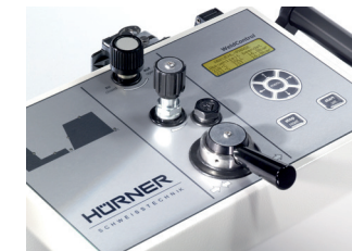
Front panel with GT keypad